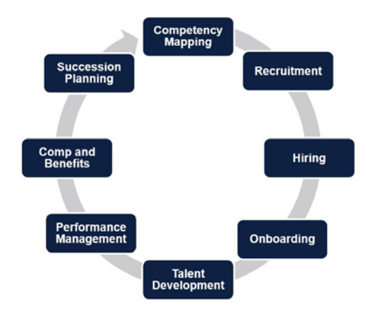
Fig.1 Talent Information Fusion Management Network Structure System

The basic principle of scientific aesthetic pre-construction is to boldly pre-construct a certain scientific theory or scientific model based on the rules of beauty, mainly the rules of scientific beauty, and the scientific research achievements, scientific research materials and experimental means already available. Knowledge and technological innovation, as the two main driving factors, need to cultivate financial management talents with good scientific and cultural literacy, solid professional foundation, strong self-study ability and innovative ability. Figure 1 shows the network structure system of talent information fusion management.